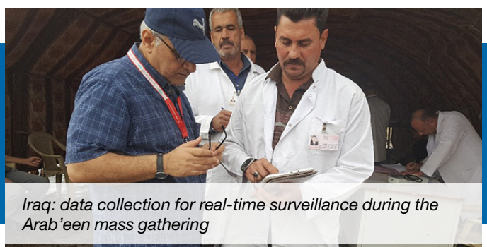
Iraq: data collection for real-time surveillance during the Arab'een mass gathering