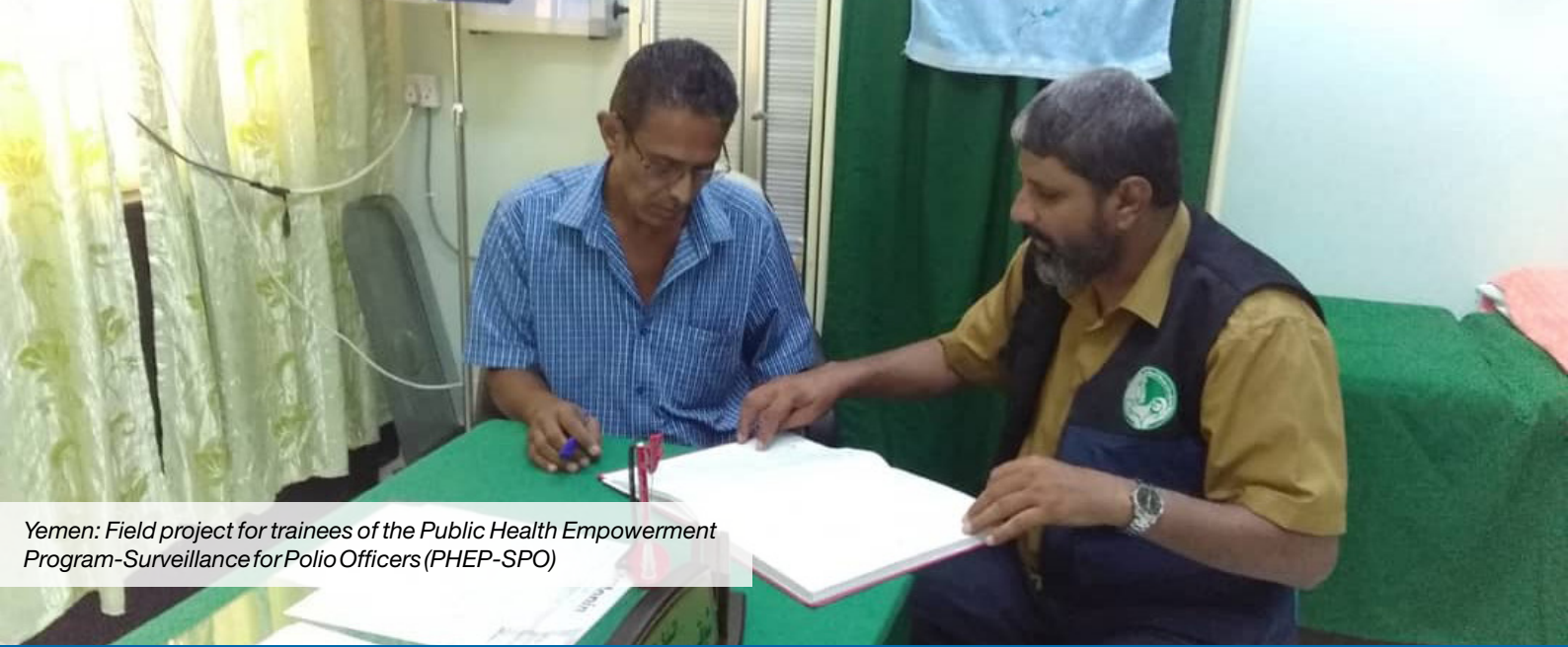
Yemen: Field project for trainees of the Public Health Empowerment Program-Surveillance for Polio Officers (PHEP-SPO)

Surveillance empowers public health practitioners and decision-makers to lead and manage their programs more effectively and efficiently. The broad scope of surveillance covers different public health focus areas from early warning systems for rapid response (in case of communicable disease outbreaks) to planned response efforts (in case of non-communicable diseases).