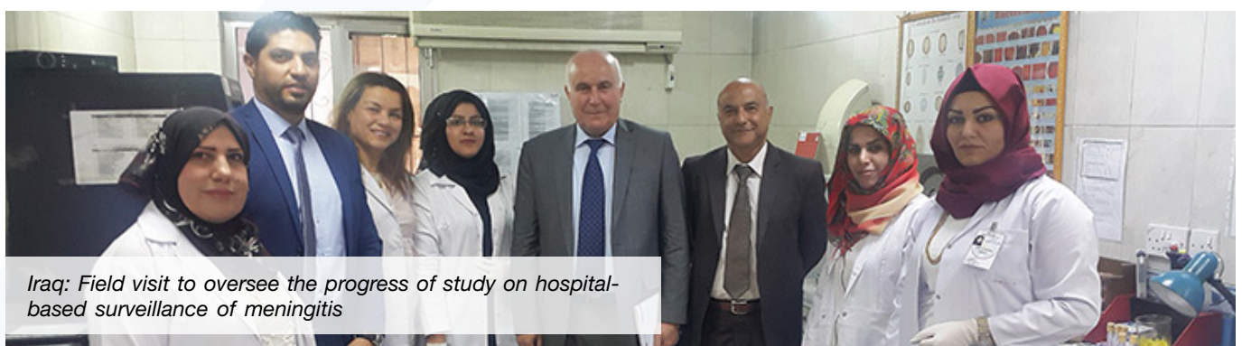
Iraq: Field visit to oversee the progress of study on hospital-based surveillance of meningitis

EMPHNET and Centers for Disease Control and Prevention (CDC) Pakistan are exploring the efficacy of mortality surveillance and civil registration systems in the country in estimating deaths during COVID-19 at district, provincial, and national levels. They conducted a retrospective study to estimate overall excess deaths and their causes during the pandemic in particular regions of Pakistan. Based on this study, a report was developed detailing opportunities for improvement that can be utilized to eventually bring about efficient interventions that can help improve the overall quality of life and quality of healthcare services for both the mother and child.