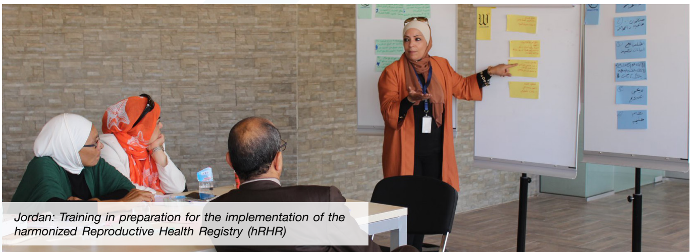
Jordan: Training in preparation for the implementation of the harmonized Reproductive Health Registry (hRHR)

Given the utmost importance of surveillance in public health, EMPHNET has been closely involved with countries' ministries of health in the Eastern Mediterranean and beyond through various types of surveillance-related activities: assessing population's health status, interpreting mortalities and morbidities and keeping track of diseases with the aim to enhance evidence-based policy formation and informed strategic prioritization, evaluating the effectiveness of interventions, improving quality of care, and strengthening early warning systems.