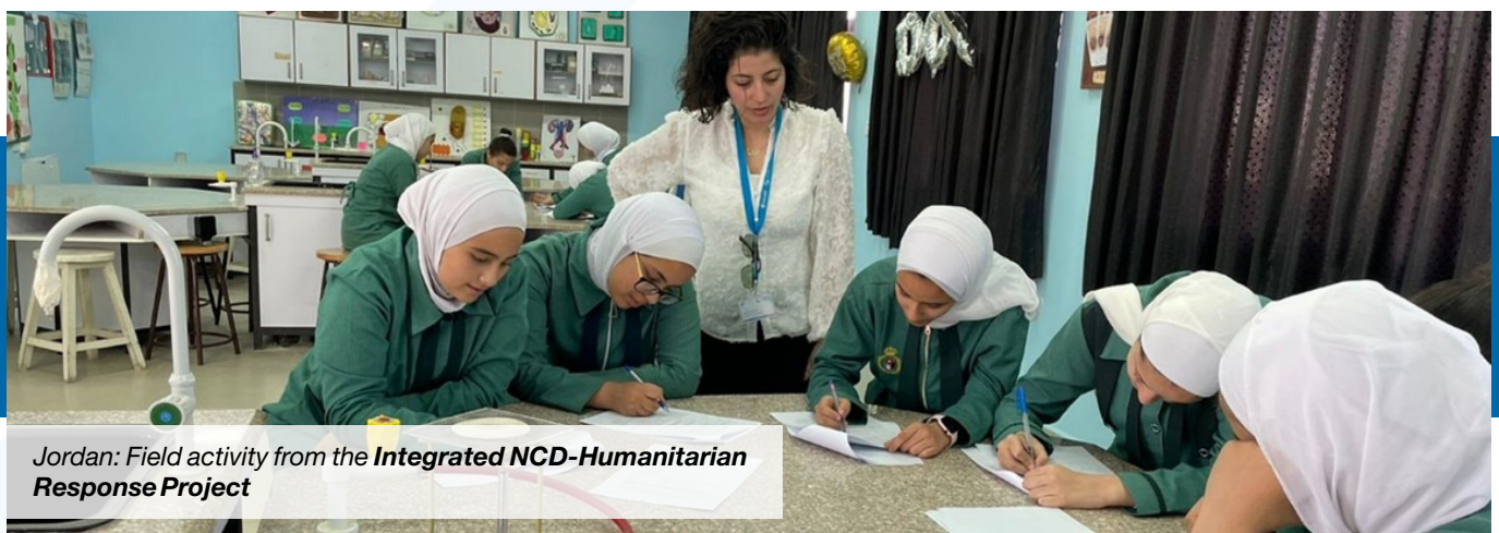
Jordan: Field activity from the Integrated NCD-Humanitarian Response Project

More recently, a large-scale, school-based cross-sectional mental health survey was launched in Jordan by EMPHNET in collaboration with Japan International Cooperation Agency (JICA), the MOH, the Ministry of Education, and the United Nations Relief and Works Agency for Palestine Refugees (UNRWA). The target population in this survey includes Jordanian children and adolescents aged between 8 and 18 years as well as of other nationalities and groups including Syrian and Palestinian refugees from public, private, and UNRWA schools in all governorates of Jordan, in addition to schools in Zaatari camp. Data from this research is expected to generate estimates on the burden of mental disorders and psychosocial problems and describe mental health seeking behaviors and barriers among the target population.