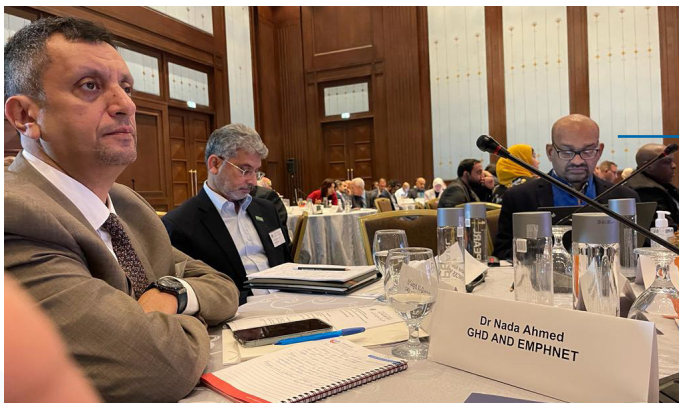
EMPHNET’s participation in the 31’st Intercountry Meeting of National Managers of Expanded Programs on Immunization