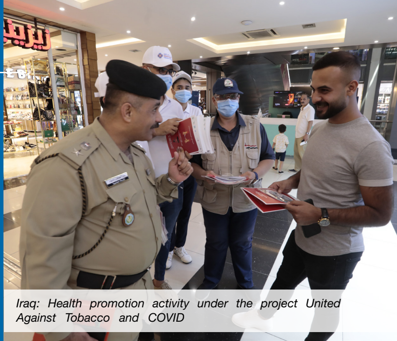
Iraq: Health promotion activity under the project United Against Tobacco and COVID

While the prevalence of non-communicable diseases (NCDs) in the Eastern Mediterranean Region (EMR) is alarmingly high, a substantial proportion of the burden is caused by modifiable risk factors. Focusing on this opportunity for change, EMPHNET is putting its strategy into action and is working with partners across countries and sectors to strengthen the prevention and control of NCDs in the EMR. Alongside ministries of health, universities, research centers, and international organizations, EMPHNET enhances national health information systems to regularly track and monitor NCDs trends and their related risk factors and advocates for national policy changes towards creating an enabling environment that promotes and reinforces healthy choices. EMPHNET also supports efforts to build the capacity of national health care systems to improve quality of care for NCDs in clinical settings and implement community-based intervention for prevention, care, and management of NCDs.