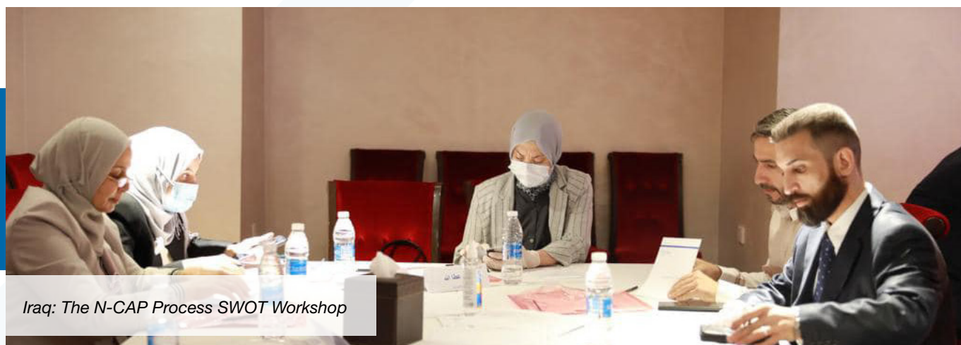
Iraq: The N-CAP Process SWOT Workshop

risk factors and their underlying determinants and strong health systems for improved prevention and control of NCDs in the EMR. EMPHNET also established the Eastern Mediterranean NCDs Research and Prevention Center (NCDs-RC) to achieve higher levels of NCDs prevention and control in the EMR through multi-sectorial, multi-disciplinary collaboration in the areas of research, training, and informed decision-making.