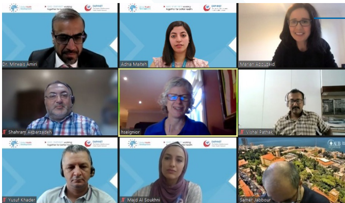
EMPHNET team facilitating a virtual session on Global Prioritization Exercise (GPE) for representatives of research and humanitarian aid entities across six geographic regions: Central and West Africa; Central Asia and South Asia; Latin America and the Caribbean; Oceania, Eastern and South-Eastern Asia; Southern and East Africa; and Western Asia and North Africa